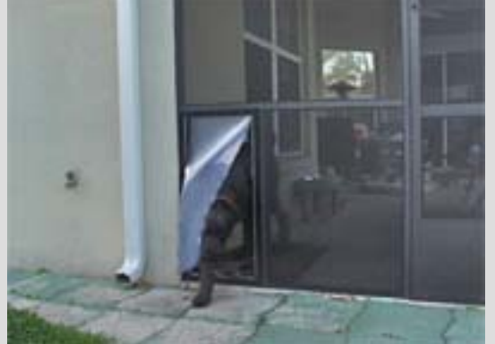
PORCHES & LANAIS